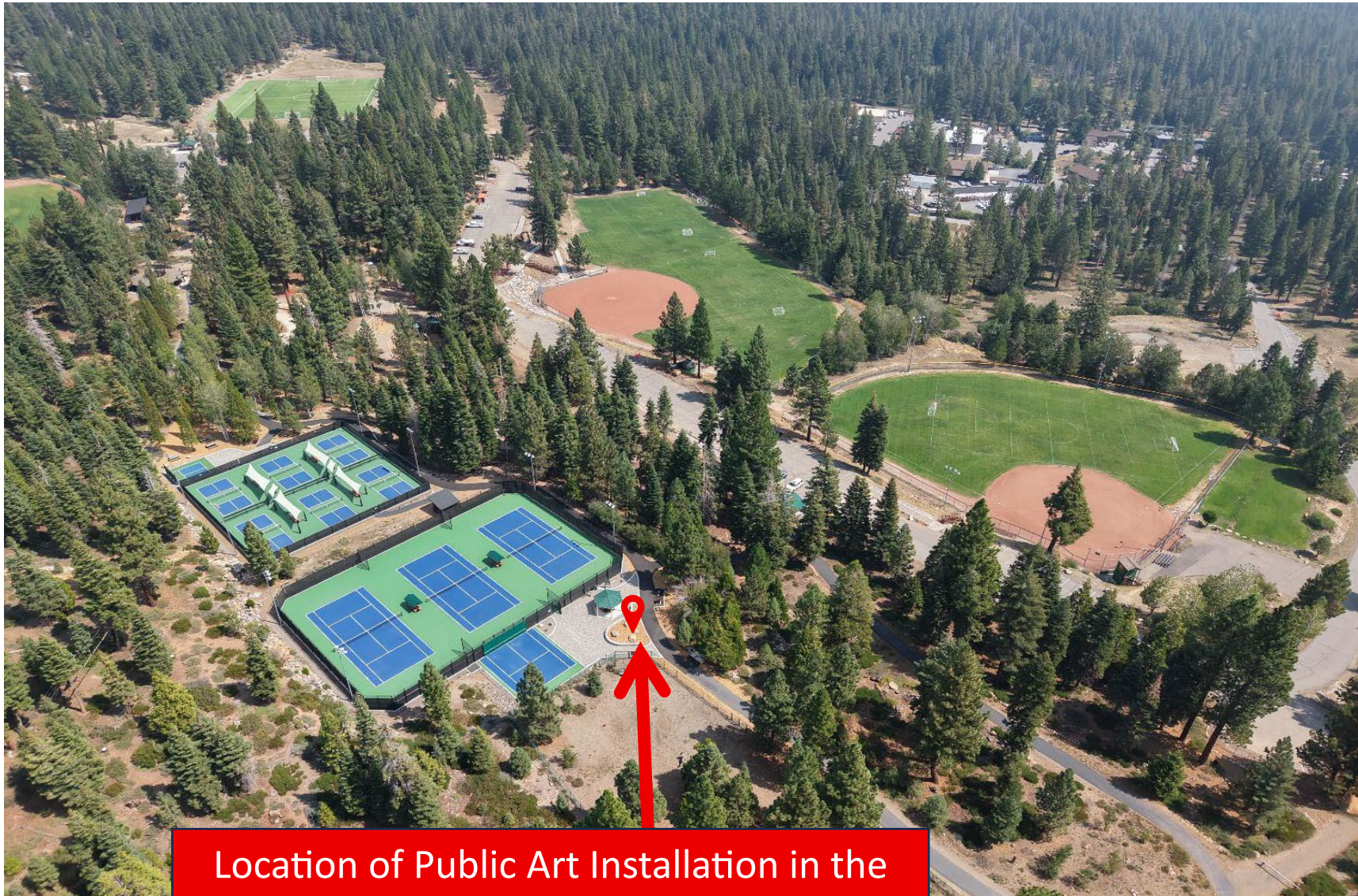
EXHIBIT A: Site location within the North Tahoe Regional Park Community Gathering Space

Location of Public Art Installation in the North Tahoe Regional Park