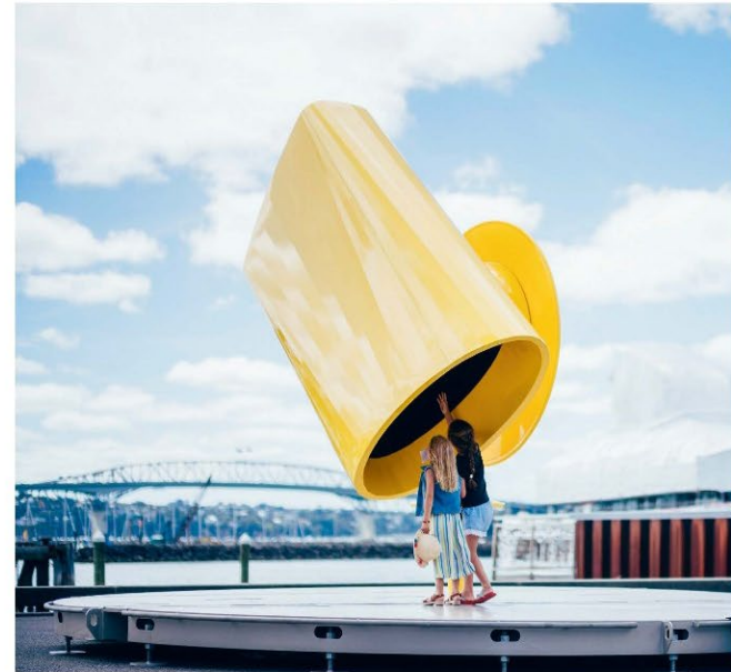
Rainbow Machine – Auckland, NZ