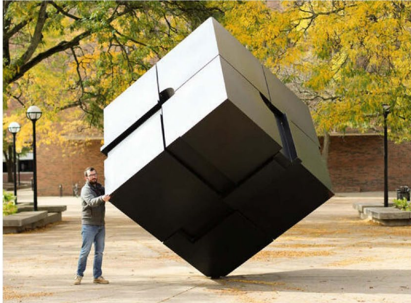
Endover (The "Cube") – Ann Arbor, MI