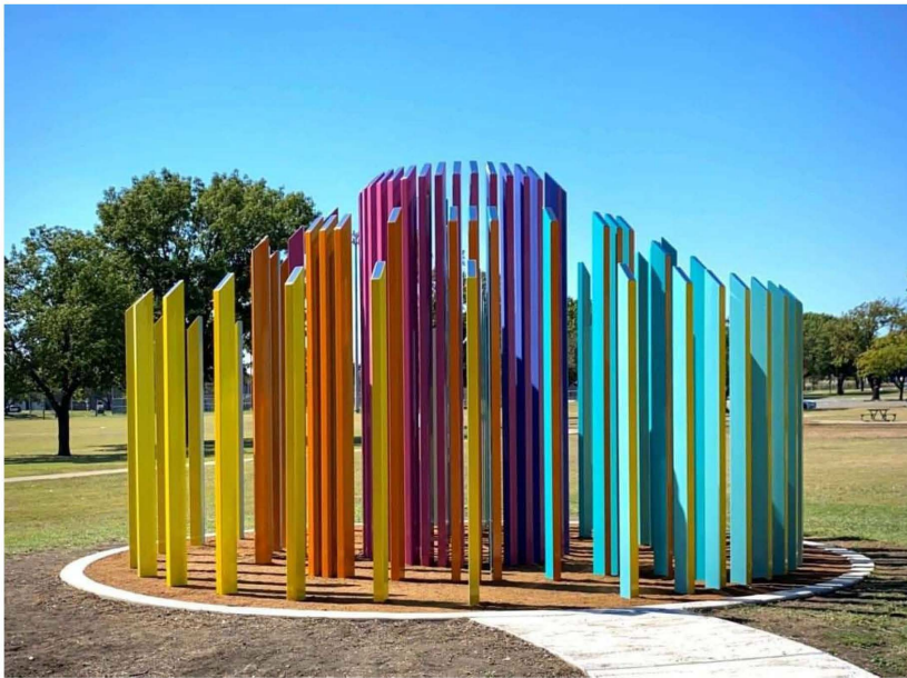
Concentric Harmony – Fort Worth, Texas