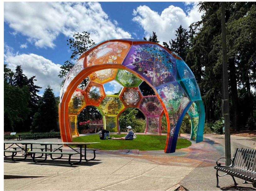
Cloud Nest, Hillsboro, Oregon