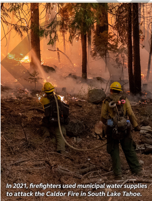
In 2021, firefighters used municipal water supplies to attack the Caldor Fire in South Lake Tahoe.

In 2018, the District's cost to construct one mile of water pipeline was approximately $1.9 million and by 2023, that cost had risen to $3.4 million — an increase of 14% per year.