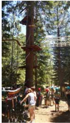
Have you tried out the TreeTop Adventure Course?

Tahoe TreeTop Adventure Course, an extension of courses in Tahoe City and Squaw Valley, brings the adventure of ropes course, zip lines and obstacle course to the regional park. The adventure course has been open since early July and has already seen over 11,000 participants come and challenge themselves. The course has seven courses, 3 levels of difficulty, 70 platforms and bridges and over a dozen zip lines. Three of the courses have platforms and zip lines that provide a view of Lake Tahoe. The course is open year round, and information on rates and hours of operation are available on the TreeTop Adventure Park's website at www.northtahoeadventures.com