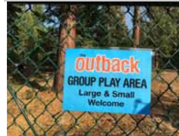
Completion of the Outback is the final phase of the Tahoe Unleashed Dog Park.