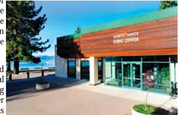
The North Tahoe Event Center in Kings Beach.

The NTPUD always puts our constituents' needs first and makes decisions based on the best available information. The status of the North Tahoe Event Center will remain a monthly topic on the Board's agenda, even if for only an update. If you can't attend the meetings and wish to receive additional information in the form of agendas or press releases, we encourage you to go to www.ntpud.org and sign up for our email updates. Video recordings of past meetings are also available on the District's website.