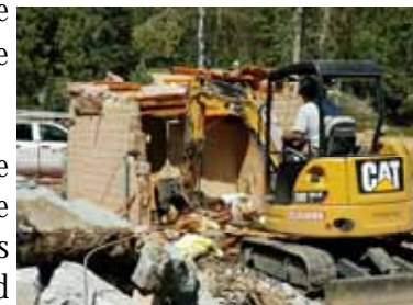
Demolition of one of the old restrooms at the North Tahoe Regional Park

Tahoe Unleashed off leash dog park opened last fall with 2 separate enclosed play areas, one for large dogs and one for small dogs. This summer, work was completed on a third area, The Outback, that doubled the size of the dog park to its final size of over 1-acre. This newest section provides an area for dogs of all sizes to play together in a natural environment yet is fenced in so they don't run off. Users of the dog park and adjacent tennis courts have commented that original concerns about the dogs barking and being too noisy have not come to fruition; the dogs play together happily and don't disturb the tennis players.