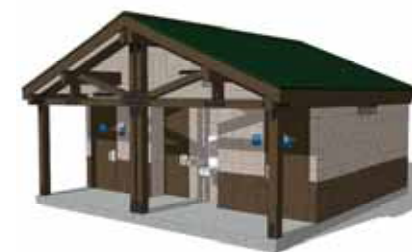
Drawing of new restrooms

Finally, the District is pleased with the progress being made on other improvements in the regional park. The permanent restrooms that were located near the lower ballfields and the uppers soccer field are being replaced with new, prefabricated restrooms. The new restrooms will reduce the amount of required maintenance while being more efficient in water and electrical use. The restrooms will be heated hydronically so they will be available for use during the winter months. New signs to help with wayfinding within the park are being designed and will be installed after the start of the new year. These signs will identify the entrance to the