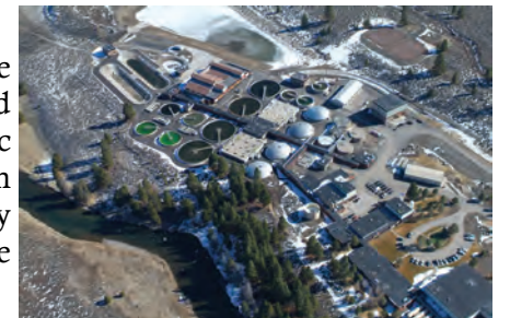
The Tahoe Truckee Sanitation Agency provides the Regional Sewage Treatment Plant for the North Shore (California) and Truckee.

The result is that the Tahoe Basin today has some of the most sophisticated and technologically advanced wastewater treatment systems in the country. Public utility districts and general improvement districts in the Basin must comply with the Federal Clean Water Act and the 1968 Porter-Cologne Water Quality Control Act, which prohibit septic tanks, sewage outfall, and the in-Basin reuse of recycled water, regardless of the level of treatment.