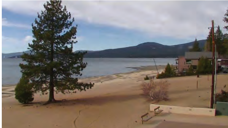
A still shot from the new web came at the North Tahoe Event Center.

We have installed a webcam at the event center! Check out this link! http://www.tahoetopia.com/webcam/north-tahoe-event-center-kings-beach