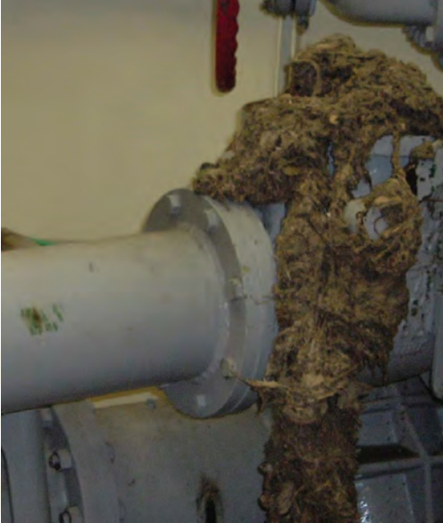
A plug that our Technicians removed in November that was caused by non-flushable items being put down the sewer.

If what you are looking to throw into the toilet or drain does not disintegrate like toilet paper, it should be thrown into your garbage can and not the toilet!