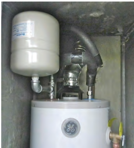
An expansion tank installed on a hot water heater.

This question comes up from time-to-time. Many District customers have water heaters that leak a little bit from their PT (pressure/temperature) valve when the unit reheats after filling. This phenomenon occurs due to the air in the tank headspace becoming compressed thereby increasing pressure in the tank. The water itself compresses a little too, but most of the compression and resultant increase in pressure is due to the heated air in the headspace. Since the PT valve on the side of your water heater typically does not activate until internal pressures exceed 150 psi (pounds per square inch), your water heater, as well as the piping within your home, may experience damage and, as a consequence, a reduced lifespan. Each use/refill/reheat cycle further stresses the water heater tank and household piping. In addition, if the PT valve is sticky or faulty and unable to relieve the increased pressure then the water heater itself may eventually rupture. This problem can usually be eliminated by installation of an expansion tank on the cold water feed side of the water heater (see the figures below). Expansion tanks themselves are relatively inexpensive (typically under $75) and installation usually takes less than an hour. That’s pretty cheap insurance to preserve that $500 water heater installation. Call one of the area’s licensed plumbers for further advise or to schedule a retrofit.