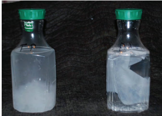
Container on the left is toilet paper, the container on the right holds a “flushable” wipe. They have both been soaking in water for 4 hours and the wipe hasn’t changed at all. If an item doesn’t disintegrate like TP, it shouldn’t go in the sewer

Although the District has seen an increasing issue with these cleansing wipes, all products which do not have the inherent ability to breakdown or disintegrate can damage or clog our pumps and pipes. Other “sewer-stoppers” known to cause these same clogging issues are: