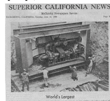
In 1968 the largest pre-manufactured sewage lift station constructed at the time was installed by the NTPUD at the base of Dollar Hill.

So in the late 1960s, the California Legislature banned cesspools and septic tanks and mandated that all effluent be pumped completely out of the Basin. Nevada followed suit a few years later.