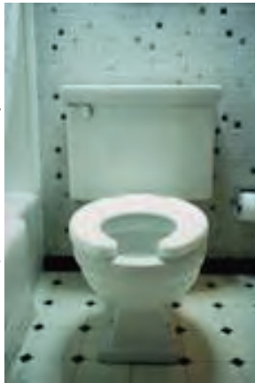
Replace old, large tank toilets like this one and receive a credit on your bill!